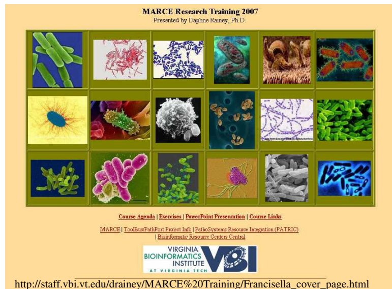
Figure 2. Web page showing course material prepared to train current scientists working on developing countermeasures against tularemia disease caused by Francisella .

The BGRC has provided collaborative research support to scientists working on emerging and re-emerging infectious diseases. A total of thirteen different collaborative research projects covering host or pathogen response on pathosystems such as