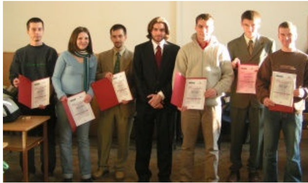
Fig.1 Winners of the Digilent Design Competition, first edition contest at TUCN, RO

Inspired by this successful experience, the first author of this paper decided to organize such a competition at Rose Hulman Institute of Technology, and asked Digilent, Inc for logistic support.