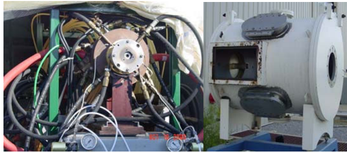
Figure 1. Experimental Setup for Electromagnetic Control of Hypersonic Shockwaves.

Figure 1 shows the experimental setting of the plasma research test fixture at the NASA Marshall Space Flight Center. As shown in Figure 1, the vacuum chamber is connected to the exit of the arc heater facility. The test article is located inside the vacuum chamber.