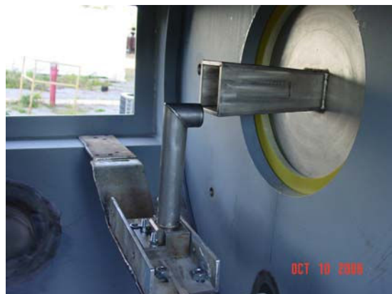
Figure 4. First production of test cradle inside the vacuum chamber.