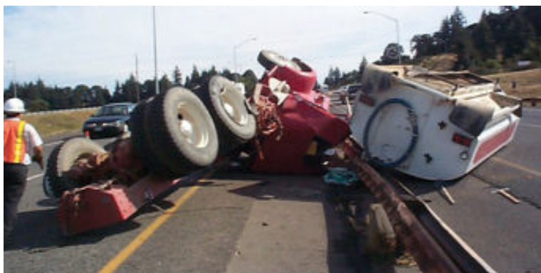
Figure 1. Crash Sample Picture [Public Roads 2004]

The United States (U.S.) heavily relies on the roadway infrastructure. As shown in Table 1 a considerable number of highway vehicle miles are driven every year. Unfortunately, the number of fatalities is staggering with accidents becoming more frequent, resulting in situations as the one depicted in Figure 1.