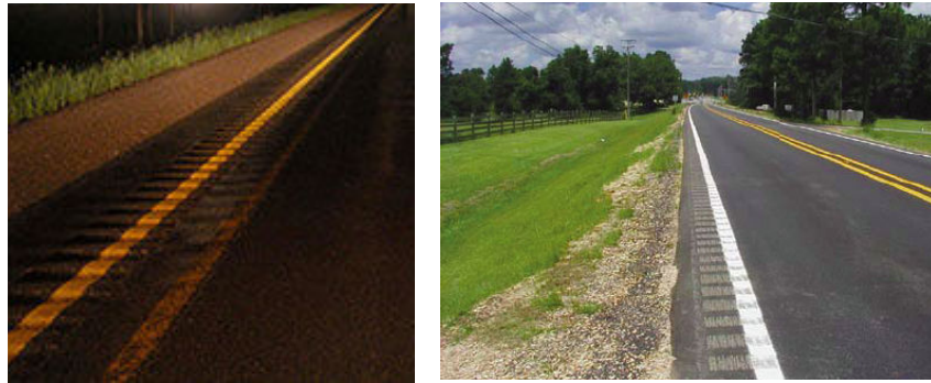
Figure 4. Rumble Stripe Sample on Roadways [Amparano, Morena, 2006] & [ATSSA 2006 - Picture by Jim Willis-MDOT]