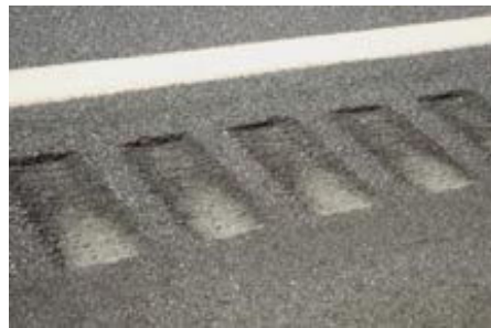
Figure 3. Rumble Strip on a Roadway [Safe Roads 2003]

Rumble Strips can be grouped in three types: continuous shoulder, centerline and transverse rumble strips. The most common type of strip is the continuous shoulder rumble strip. These are located on the road shoulder to prevent roadway departure crashes on expressways, interstates, parkways, and two-lane rural roadways. Centerline rumble strips are used on some two-lane rural highways to prevent head-on collisions. Transverse rumble strips are installed on approaches to intersections, toll plazas, horizontal curves, and work zones [FHWA 2007a].